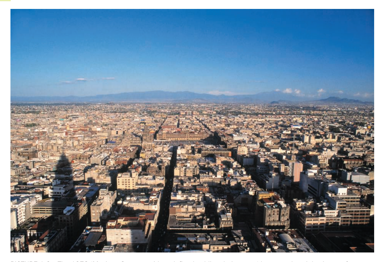
PICTURE 1.2 The 1978 'Mexican Statement' has defined public relations as 'the art and social science of analyzing trends, predicting their consequences, counselling organizational leaders, and implementing planned programs of action which will serve both the organization and the public interest'.

influence. You could argue that this kind of flexibility means simply that practitioners have difficulty explaining exactly what their job entails – and indeed, this seems to be the case.